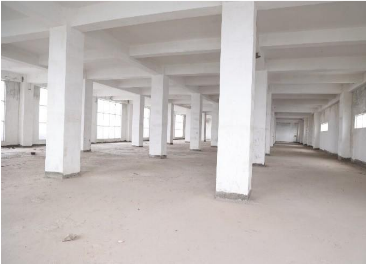
Site Photograph of offered commercial space with tentative area